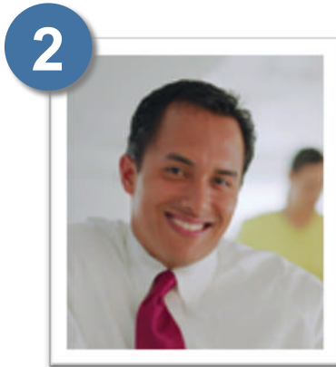
..... name ..... Andy. He ..... from Australia.