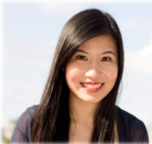
Keiko - Tokyo